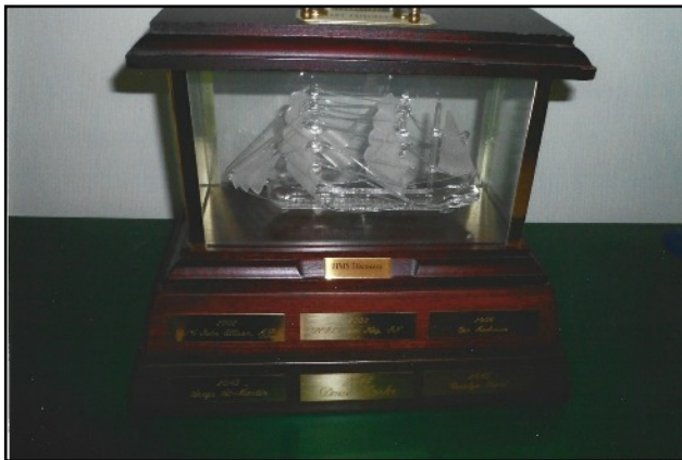
Mary Pritchard Award