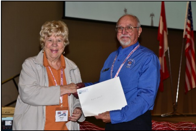
Mary Pritchard Award