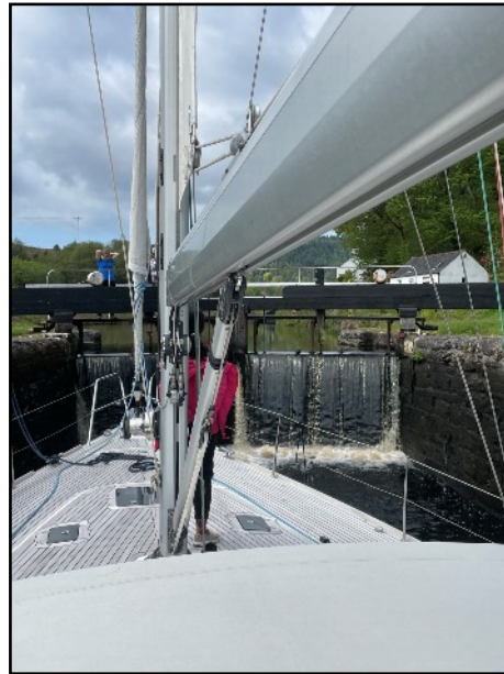
Crinoline Canal lock

currents, presented both challenges and delights. Imagine our surprise at encountering playful dolphins in waters as chilly as 13 degrees Celsius! Our first port of call was Rothesay, where we indulged in a feast of fresh langoustines and mussels, a tantalizing prelude to the gastronomic adventures that lay ahead.