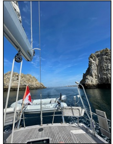
Attention to water depth were important when navigation near shore

As we ventured southward, the landscape grew increasingly