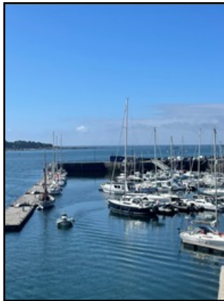
Typical port in Britany France

When we set sail for our next destination, we encountered a shocking event. Shortly after leaving the harbor, we were met with rough seas reaching approximately two meters, compounded by rainy weather. As we battled the elements while sailing close-hauled, it became evident that the motion and rain were too much for an unexpected passenger onboard.